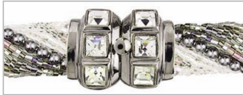
exotic and elegant ruthenium finish with crystal