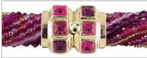
combine colors to create a stunning focal piece